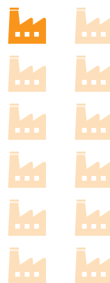
TIWI can reduce household GHG emissions by up to 3.3%