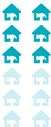
Half of homes surveyed needed remedial work before retrofit